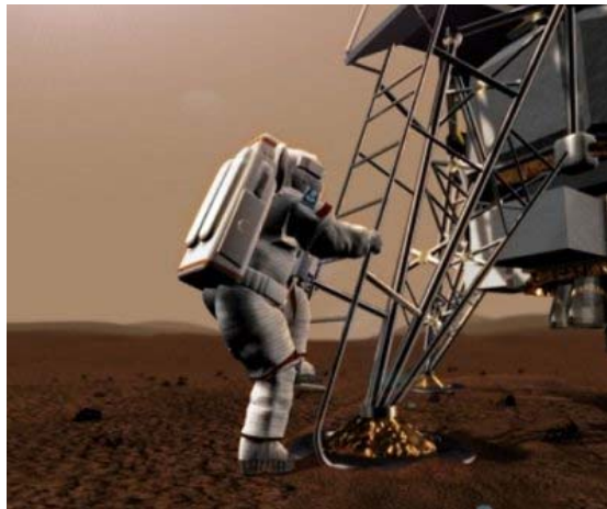
Artist's impression - human mission to Mars

The candidates will be selected based on education, professional experience, medical fitness and social habits. Following a positive pre-selection assessment, potential candidates will have to submit results from medical tests and will then be invited for an interview, during which they will be screened in a process similar to that currently used in astronaut selection. Accepted candidates will have the opportunity to pose any question they may have concerning the Mars500 programme,